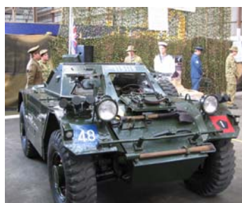
The Ferret was on guard.