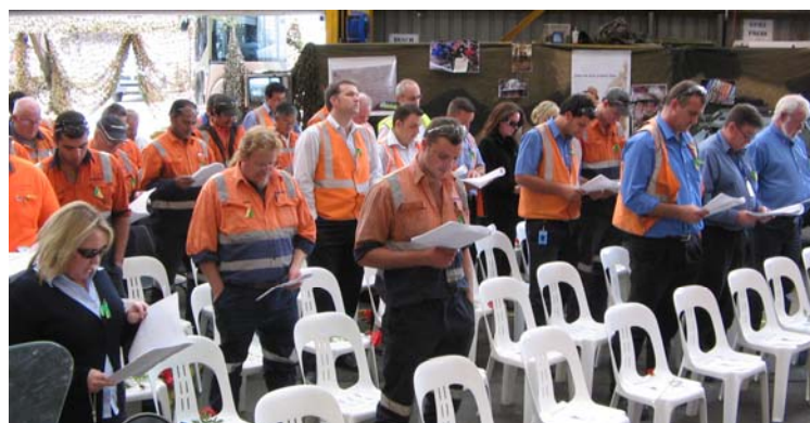
A full service was conducted and included: the last post; raising the flag; and staff singing hymns and National Anthem.