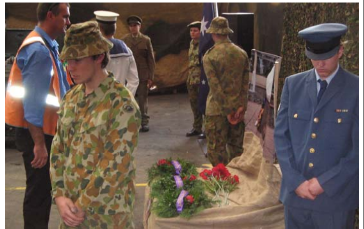
The ceremony included Wreaths and Poppies being laid.