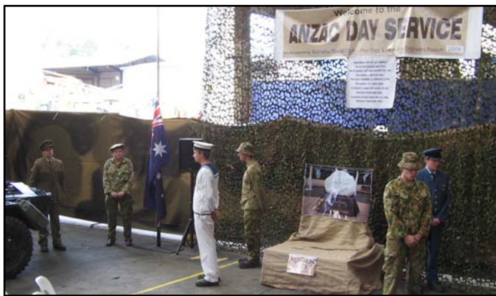
Staff dressed in appropriate uniforms so that all ADF services were represented.