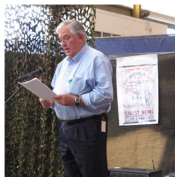
Many staff were involved during the ceremony with readings, poems and hymns.