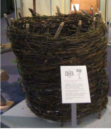
A wickerwork gabion basket