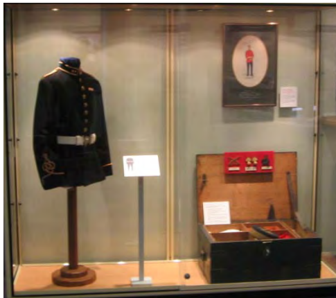
An engineer's possessions